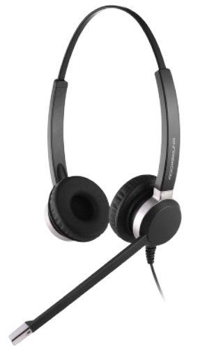
CRYSTAL SR 2822